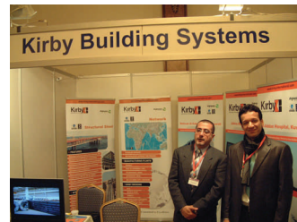
Kirby Kuwait sales team at the Fast Track Hospital Construction Conference and Exhibition.