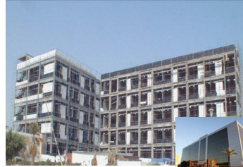
Mubarak Al Kabeer Hospital, Kuwait