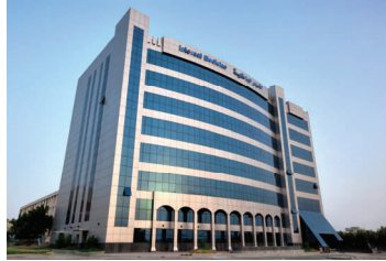
Al Addan Hospital, Kuwait