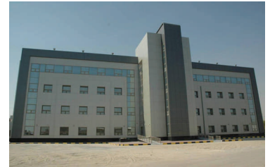
Jahra Hospital, Kuwait

Kirby participated in the inaugural Fast Track Hospital Build Conference and Exhibition held from 17-18 January 2011 at the Convention Center, Hotel Movenpick, Kuwait. The event was organized under the patronage of His Excellency Dr. Hilal Al Sayer, Kuwait Minister of Health and was attended by over 250 delegates.